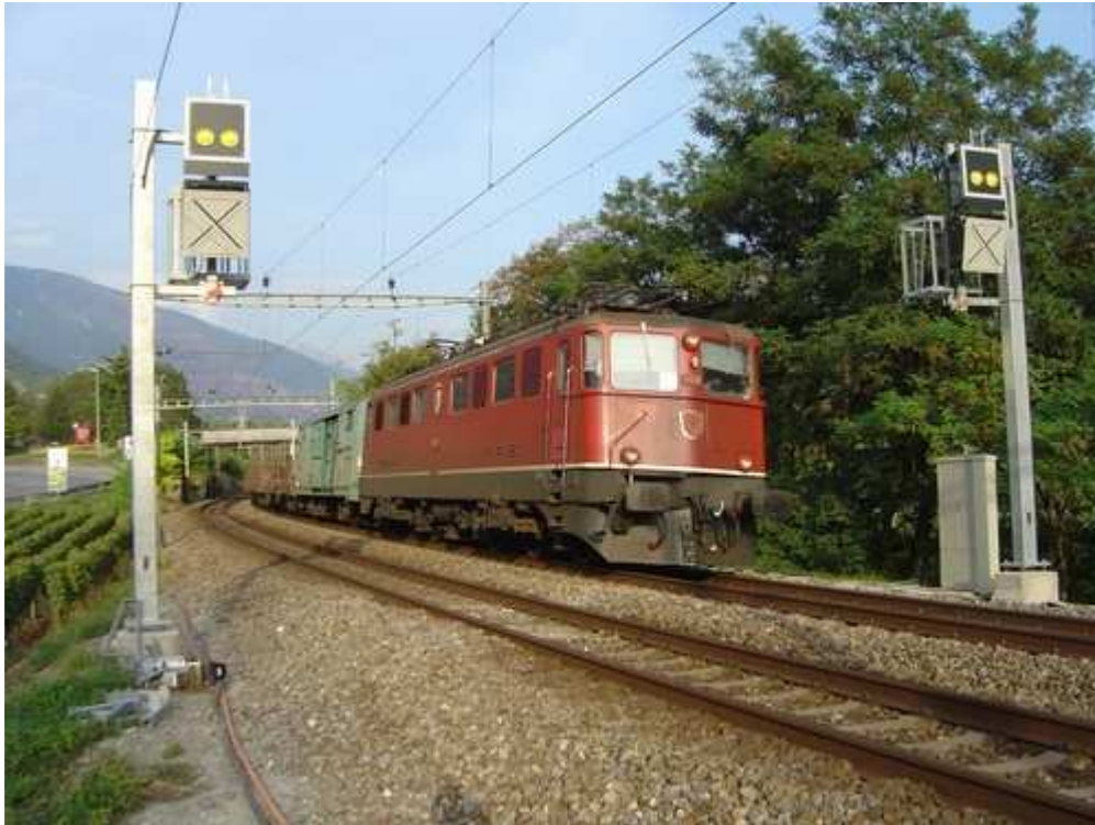
An SBB express freight...