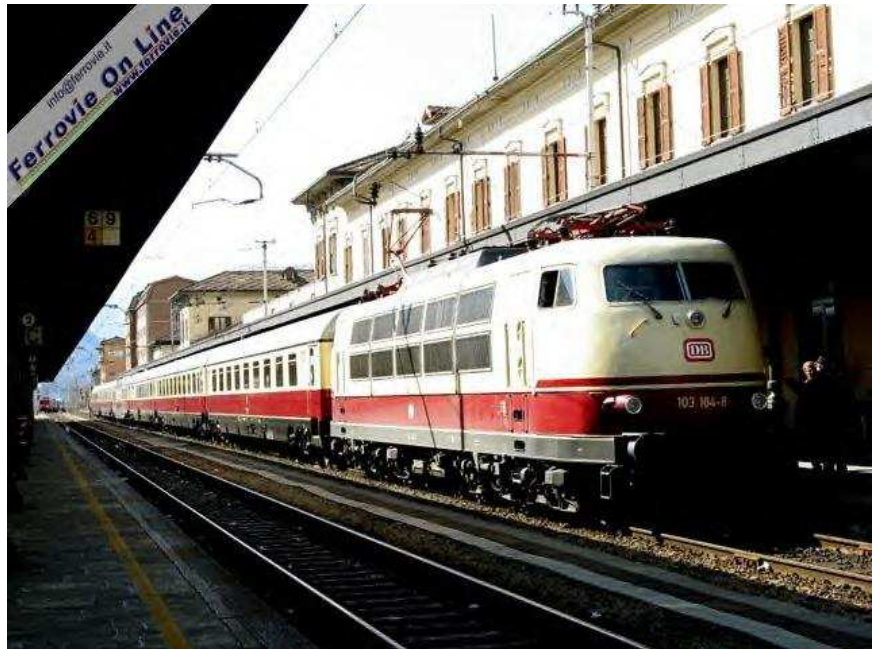
Interesting! With the new Alptransit Tunnel under the Loetschberg (now hardly a mountain line now) this preserved 103 (which doesn't have regenerative braking) can now go all the way to Domodossola (end station for the 15kV / 16.67 Hz catenary), of course providing it has a SBB narrow pantograph. (Picture taken March 25, 2008)