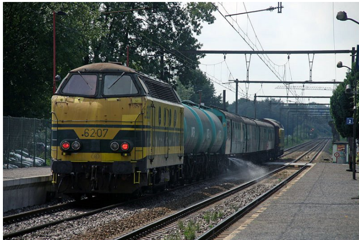
Picture of Month Detail: Belgian SNCB weed killing train, at Limal near Ottignies.